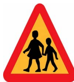
Please respect our car park policy

and do not enter the car park if you do not really need to, especially at peak times (9am, 12pm, 1pm and 4pm). There is plenty of alternative parking available near to the Centre.