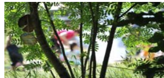
Haven Forest will be well used this autumn

This year also sees the launch of our Forest School (more below) and we hope that all Centre users will benefit from this exciting development.